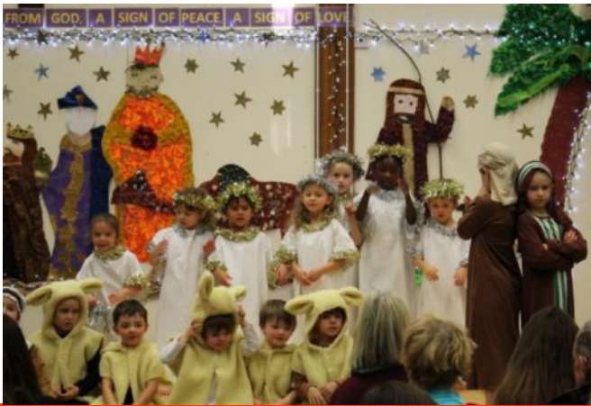
Right : Monday 2nd December at Busbridge Church. Buddy the Dog handed out mince pies & gingerbread men to celebrate the launch of the Advent 'Angel of the South', (far right) lighting up the church entrance.