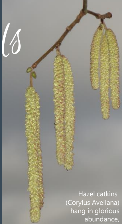
Hazel catkins (Corylus Avellana) hang in glorious abundance, dripping in golden pollen.