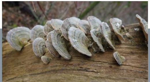
Above : Stripped bare, winter silhouettes take on a sculptural form to admire.