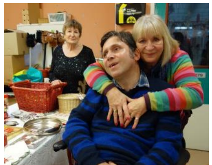
Above : The Hydon Hill Christmas Fair on Thursday 28th November.