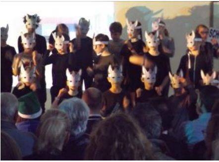
Above : 'Tinsel and Tea Towels'

We have a host of extra-curricular activities planned for the Spring Term. These include a Happy Monday Dance Day in January (our way of celebrating so called Blue Monday) and our first One World Week in February.