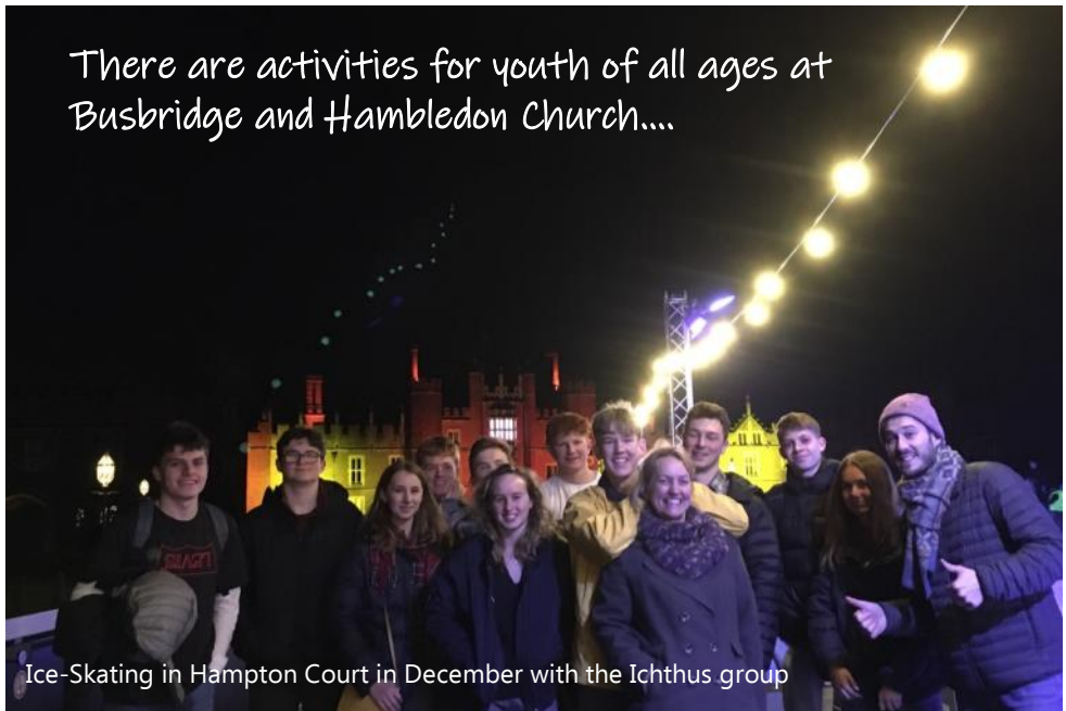
Ice-Skating in Hampton Court in December with the Ichthus group